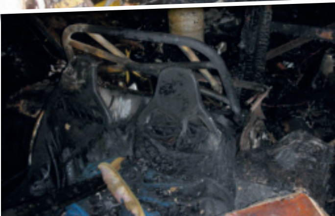
The scene of the devastating fire at Freestyle's premises which spelled the end for the business.