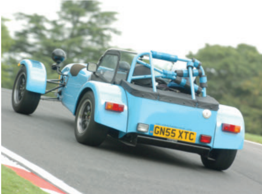
'Supawide' pushrod front suspension, louvered front wings and extra wide rear wings denote a Freestyle car. Meanwhile, the rear diffuser aims to clear up the airflow at the rear for improved high-speed stability.

with the engine's impressive torque, a 6-speed option would be unnecessary for most owners, even on track. Lightweight Avo dampers, easily adjustable from road to circuit use and back by clicks on a dial, were selected for their compactness, performance and simplicity of use. Finding rear wings wide enough to bridge the gap between the S3's rear body and the extra length of the SV axle was more of a dilemma meanwhile, and Gary's first solution here was to create a mesh spacer to sit between the standard rear wing and the wheel arch. "I liked it aerodynamically because it let the air through, but Len hated it - he said 'that's SO ugly'. So we changed it ...and went instead for a new, wide wing." But two other important aerodynamic features remained central to the car's concept and identity. The distinctive 'louvre' front wings derived from Gary's awareness that "Caterham front wings created a lot of lift, so I was always looking at ideas to stall the air off the top. With the high potential top speeds coming from up to 270bhp, this was even more important. Prototype racing sports cars often had louvered wings to relieve pressure underneath and to try to create downforce from the high pressure that the wheel generates". Moreover, a minor but welcome side effect of designing